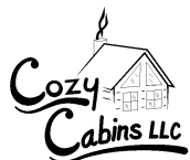
30x48 CHALET Plan #30CH1605